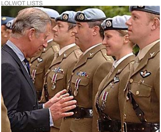
These 21 Photos Were Timed to Perfection And They're Hilarious ViralTide