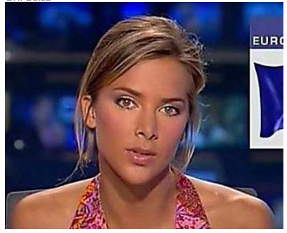
Beautiful News Anchors - Watch What Happens Next