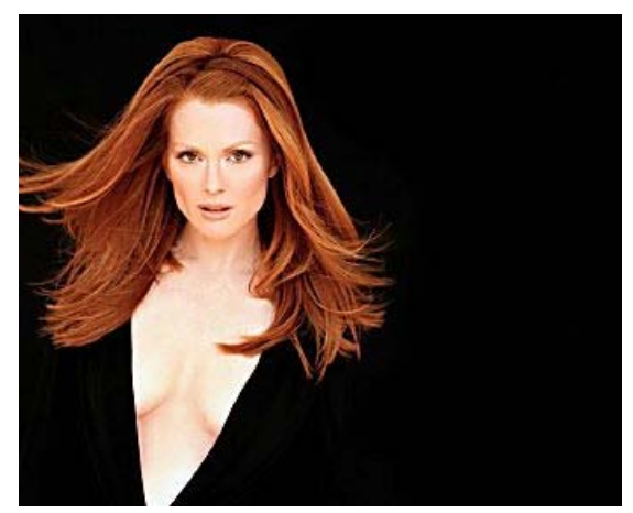
15 Of The Hottest Female Red-Headed Celebrities